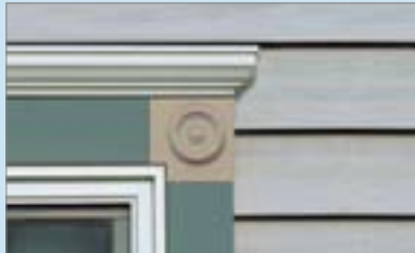
Vinyl Carpentry® Trim