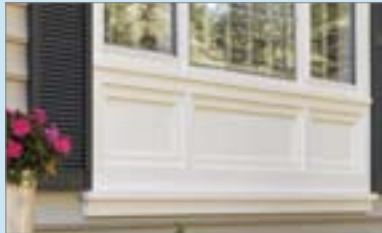
PVC Exterior Trim & Beadboard