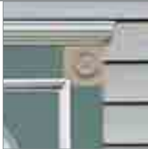
3-1/2" Lineal with Crown Molding, Corner Block and Rosette