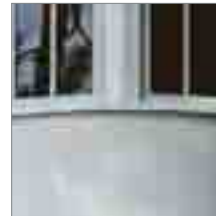
Trimboards, Sheets, Corners, Beadboard, Brickmould, Drip Cap and more...

Restoration Millwork® cellular PVC trim makes an authentic statement on your home. Available in smooth and realistic woodgrain TrueTexture™ finish in a wide variety of traditional and specialty profiles - you can also mill it or paint it to create custom designs.