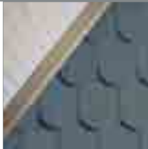
Cornice Molding with Cedar Impressions Half-Round accents and Vinyl Carpentry Triple 2" Beaded Soffit