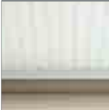
Beaded Triple 2" Panel with Soffit Cove Molding