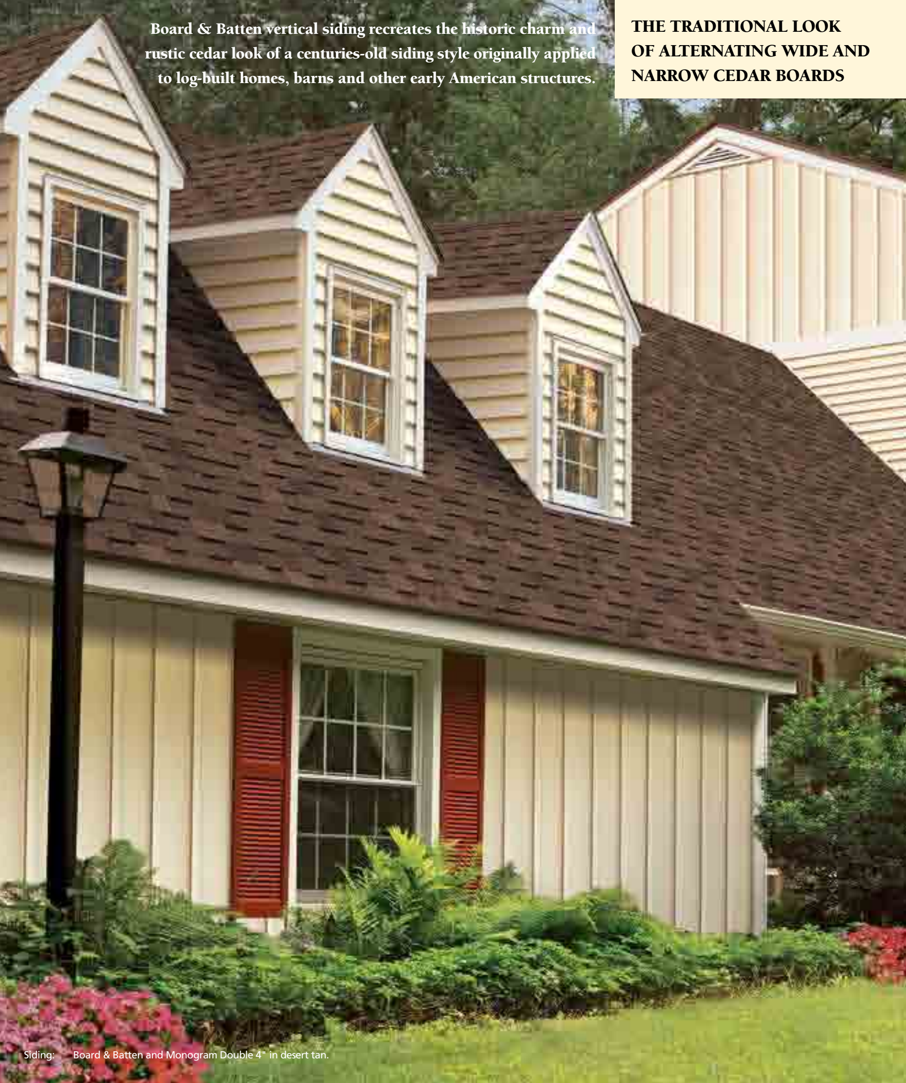
Siding: Board & Batten and Monogram Double 4" in desert tan.

THE TRADITIONAL LOOK OF ALTERNATING WIDE AND NARROW CEDAR BOARDS