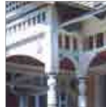
Column Enclosures, Soffit, Fascia or Custom Milled Designs