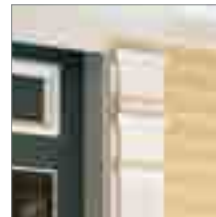
Window & Door Casings, Panels, Detailed Millwork and Special J-Pocket Accessories for Vinyl Siding