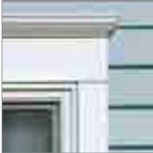
5" Lineal with Crown Molding