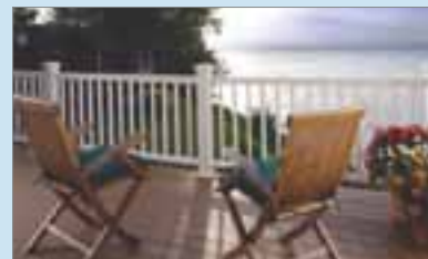
Decking and Railing