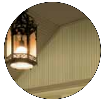
Beaded Triple 2\"/>