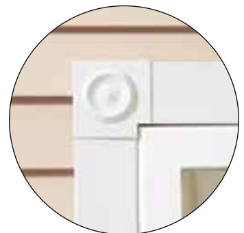
Patented Corner Block and Rosette This Vinyl Carpentry final finishing touch for wide window and door corners has historic precedence.