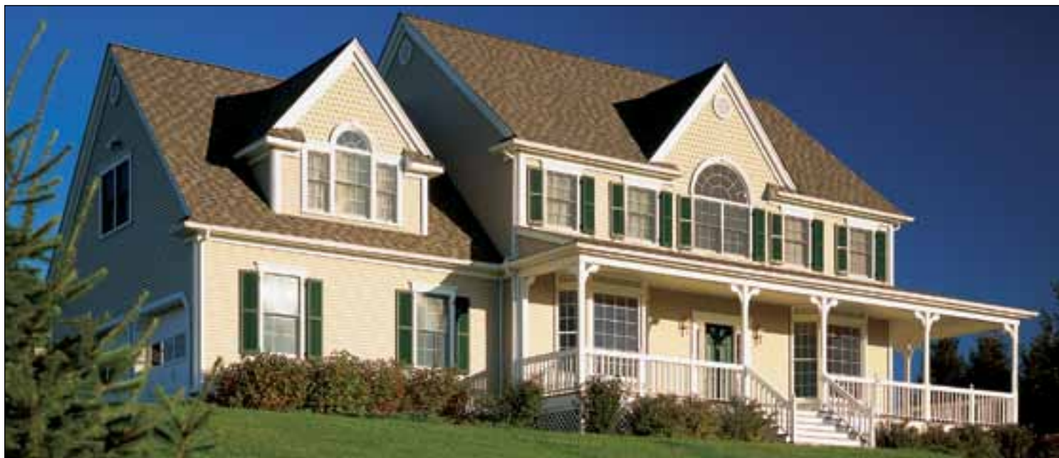
Above: This remodeled home features American Legend D4" Clapboard siding and Cedar Impressions Half-Rounds in the gables, both in heritage cream. Trim is Vinyl Carpentry® and Restoration Millwork®.

With STUDfinder™ and GripLock™ for Smooth, Attractive Installations