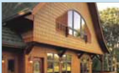
Fiber Cement Siding