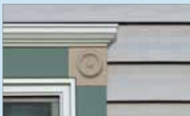
Vinyl Carpentry® Trim