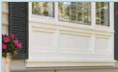
PVC Exterior Trim & Beadboard