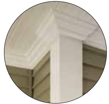
Crown and Base Cap Restoration Millwork Crown and Base Cap build-up with Beadboard Panel ceiling.