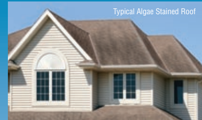
Typical Algae Stained Roof

When black algae streaks take over, it not only looks terrible, it also makes your house appear old and dirty, and reduces the curb appeal and value of your home.